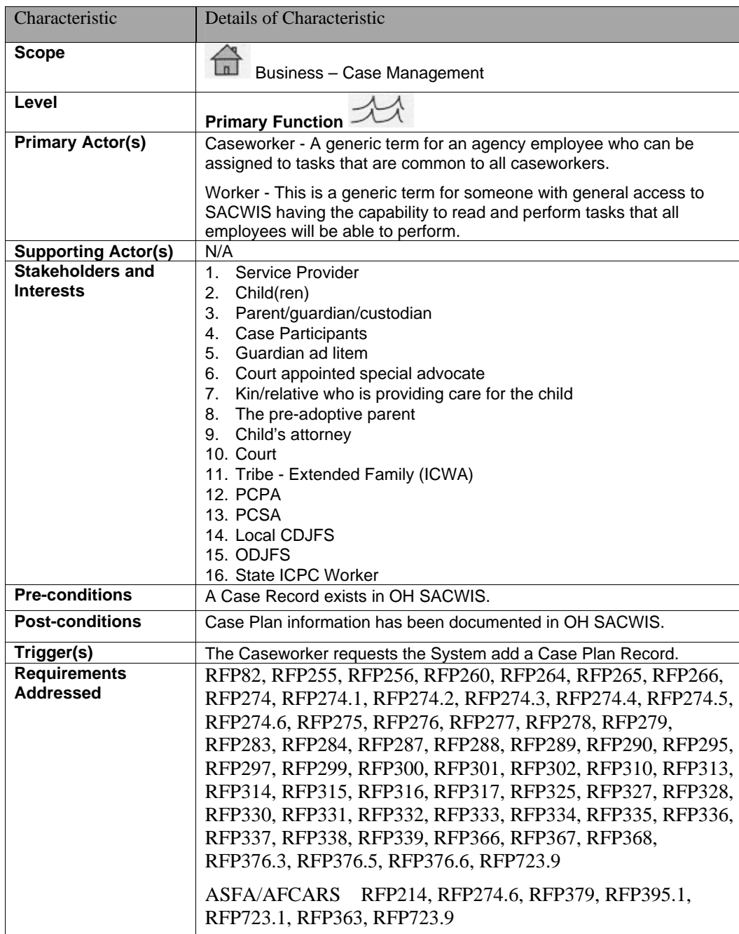
Figure 1 – Characteristic Information